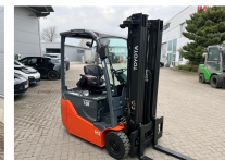
TOYOTA Werksüberholt / Factory refurbished