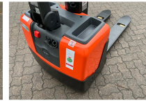
TOYOTA Werksüberholt / Factory refurbished

Price: 3.950,00 € (excl. VAT.) (Subject to prior sale)