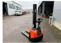
TOYOTA Werksüberholt / Factory refurbished