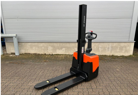
TOYOTA Werksüberholt / Factory refurbished

We expressly point out that the above statements on the device do not represent any represent warranted characteristics. These are to be inquired directly with the responsible salesman in our house However, only the information/properties according to the content of the purchase contract are ultimately relevant.