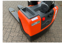
TOYOTA Werksüberholt / Factory refurbished