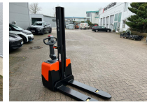
TOYOTA Werksüberholt / Factory refurbished