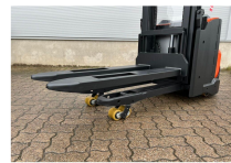
TOYOTA Werksüberholt / Factory refurbished