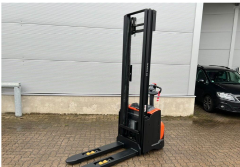
TOYOTA Werksüberholt / Factory refurbished

We expressly point out that the above statements on the device do not represent any represent warranted characteristics. These are to be inquired directly with the responsible salesman in our house However, only the information/properties according to the content of the purchase contract are ultimately relevant.