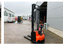
TOYOTA Werksüberholt / Factory refurbished