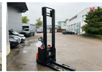
TOYOTA Werksüberholt / Factory refurbished

Price: 6.450,00 € (excl. VAT.) (Subject to prior sale)